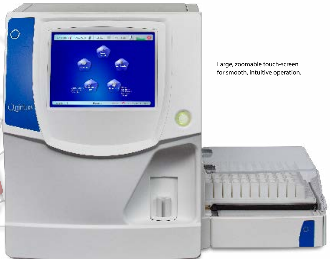
Large, zoomable touch-screen for smooth, intuitive operation.

Quintus brings together a high-quality instrument with integrated workstation, easy-to handle reagents and a large-format, user-friendly interface. It's a complete 5-part hematology system delivering accurate and reliable CBC results with the choice of work-saving walk-away automation.